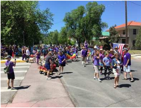
Marchers were invited to wear purple